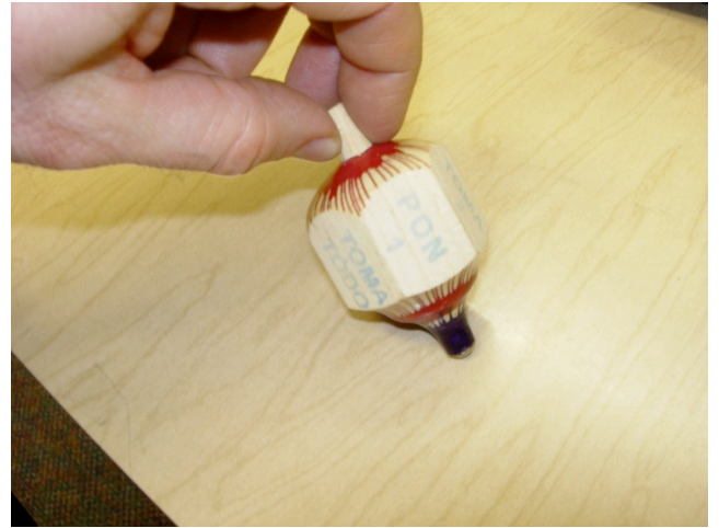
pirinola